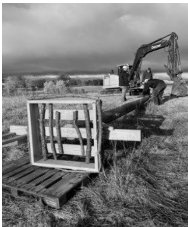
Osprey platform about to go up on 45 foot telephone pole