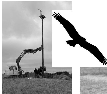
Pole is buried down 7.5 feet