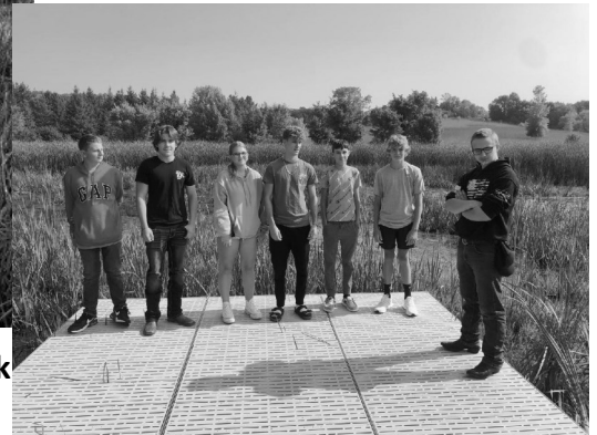
Biology students on the new dock and in front of the osprey pole (below)