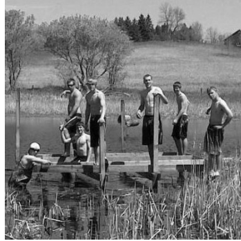
Repairing the wood dock on senior skip day in 2013

The following donated towards the dock & Osprey pole: The Starbuck Fireman's Aux., Glacial Ridge Pheasants Forever, Glacial Lakes Recreation, MAS, Pope County Pheasant Restoration, Lundblad Construction, and the PHCT. Thank You!