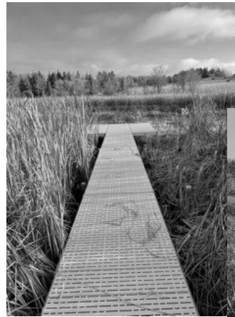
67 foot aluminum dock Cows grazing in the distance