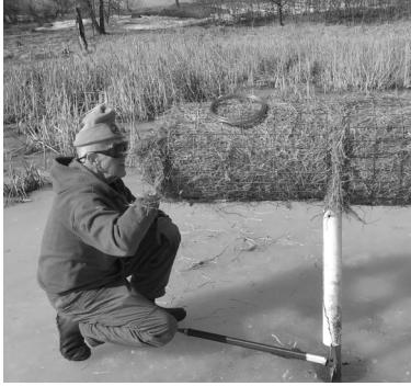
Jerry Matison checking to see if mallard nest had been used